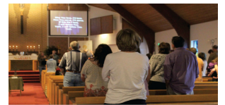
Modern ● Worship

This is a reminder that every fourth Sunday of the month we will gather for Modern Worship in place of our Blended Service at Living Christ Lutheran Church. All are invited to join us for an uplifting service filled with modern songs, meaningful worship, and time together in God's Word. It will be a joyful opportunity to praise the Lord in a slightly different style that is modern yet distinctly Lutheran, proclaiming Christ and His promises. We hope you will come and worship with us — and feel free to invite a friend!